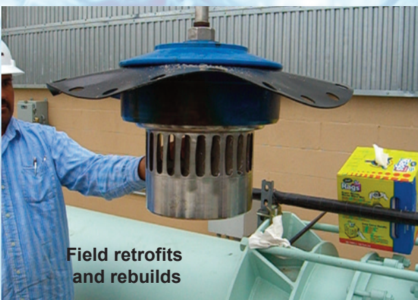
Field retrofits and rebuilds