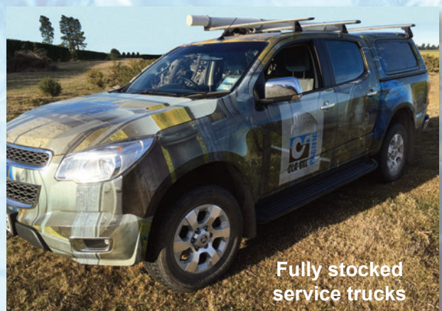
Fully stocked service trucks