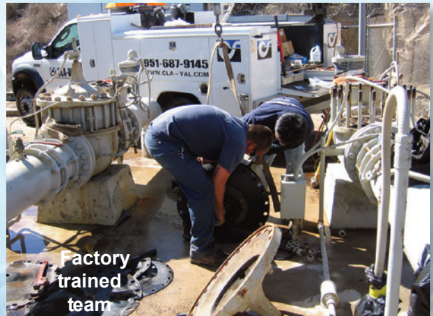
Factory trained team